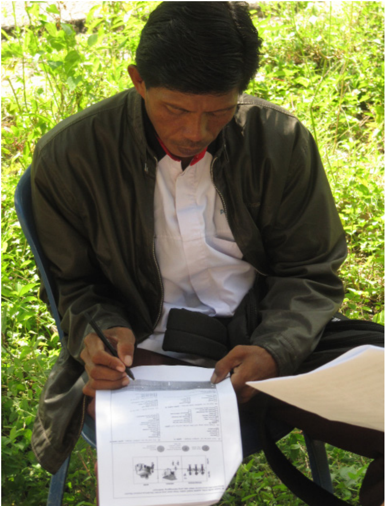
An Indonesian cocoa farmer interprets his own story using the SenseMaker-based Inclusive Business Scan.