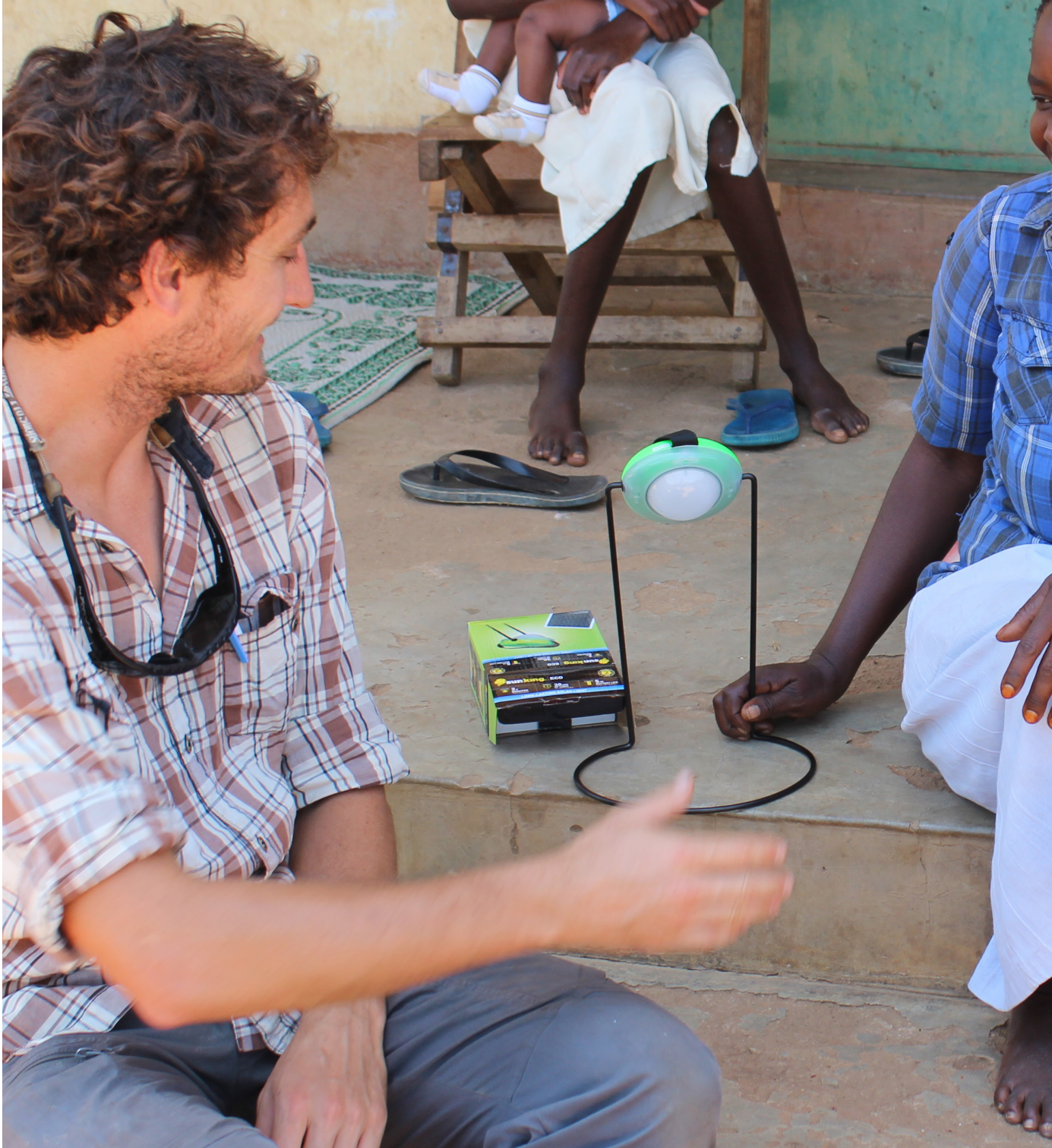
MIT D-Lab researcher explaining the objectives of a cookstove adoption study in Soroti, Uganda.