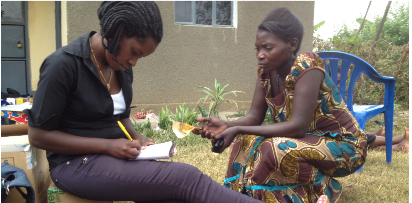
Agricultural waste charcoal briquette user research study, Soroti, Uganda, MIT D-Lab.