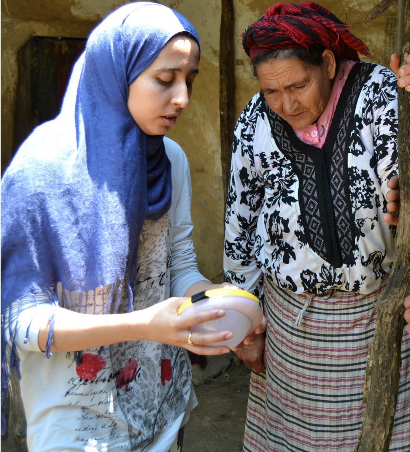
Researcher carrying out a solar light technology evaluation in Morocco.