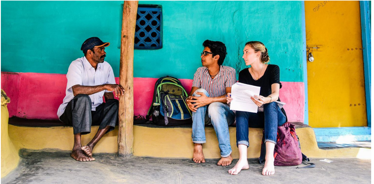
MIT D-Lab xylem water filter research in Uttarakhand, India.