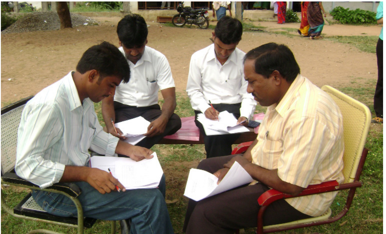
Research project in Andhra Pradesh, India.

When working with enumerators and interpreters, Tufts University has a conversation beforehand asking about their goals and why they are involved in the research. They also ask about what aspects of the research they find most exciting and which aspects they find less interesting, difficult, or potentially risky. This helps inform both the research and the understanding of their experience.