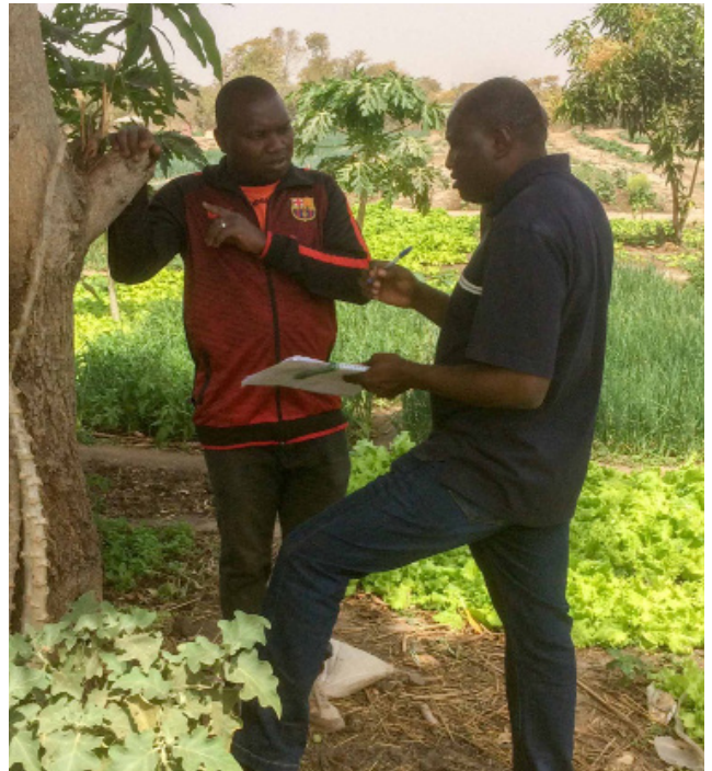
MIT D-Lab partner conducting interview in Mali.

The resulting library of hundreds of indicators measure the social, environmental, and economic elements of sustainability with a focus on rural communities. COSA's indicators are formulated carefully to comply with a number of SMART criteria (Specific, Measurable, Achievable, Realistic, and Trackable), so that they are practical to use and provide actionable information.