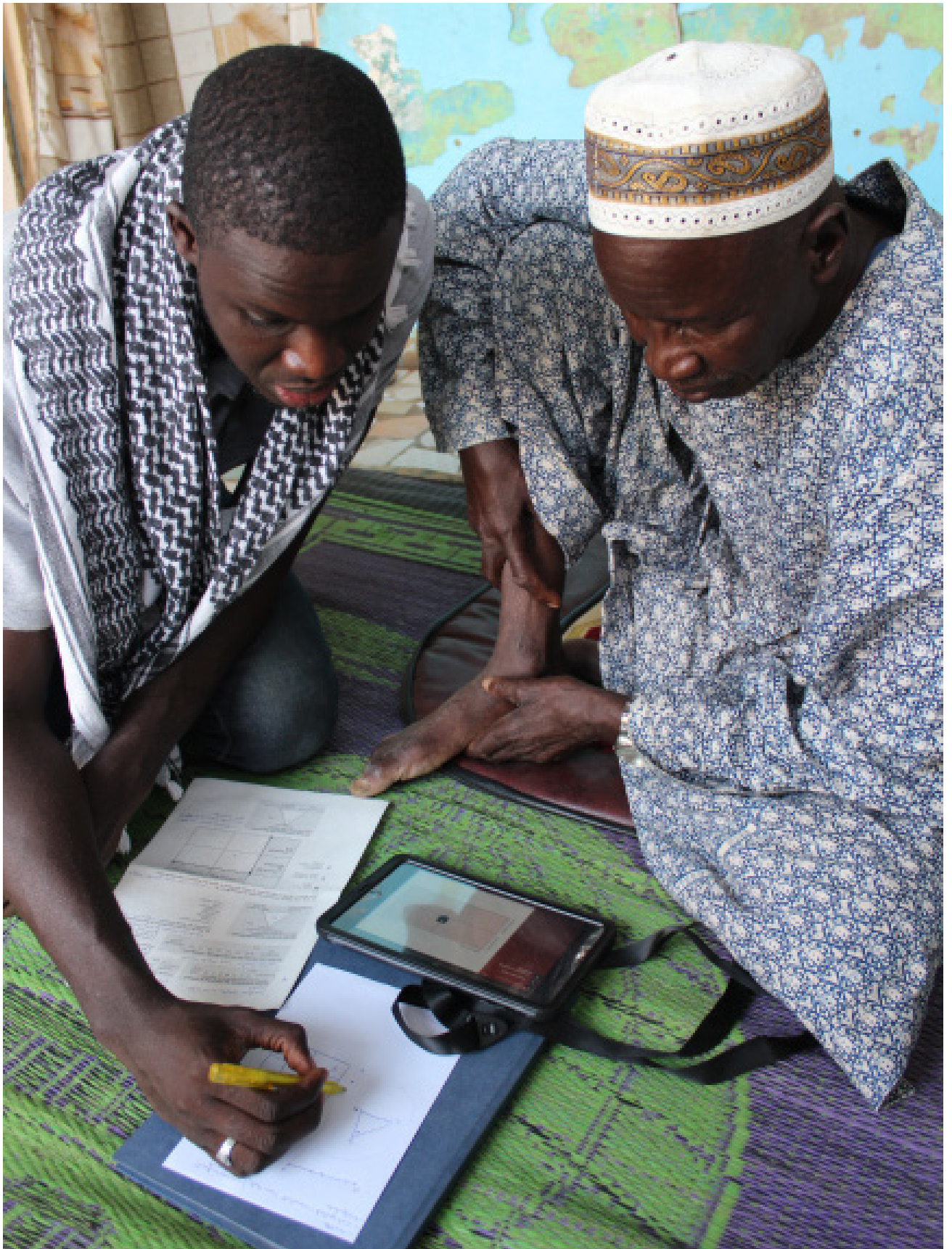
An enumerator explains the use of triads to help a Senegalese farmer self-interpret his story, using the Inclusive Business Scan.