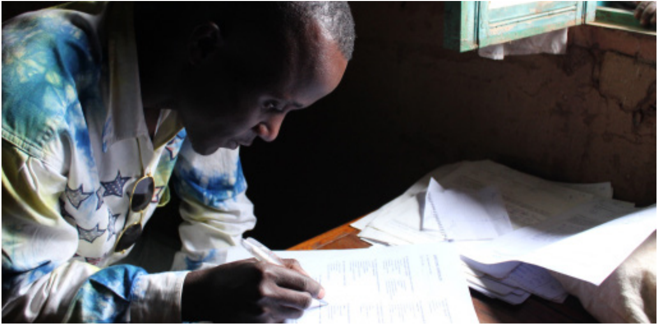
A coffee farmer in DR Congo interprets his experience of selling coffee through the Kawa Kabuya Cooperative.