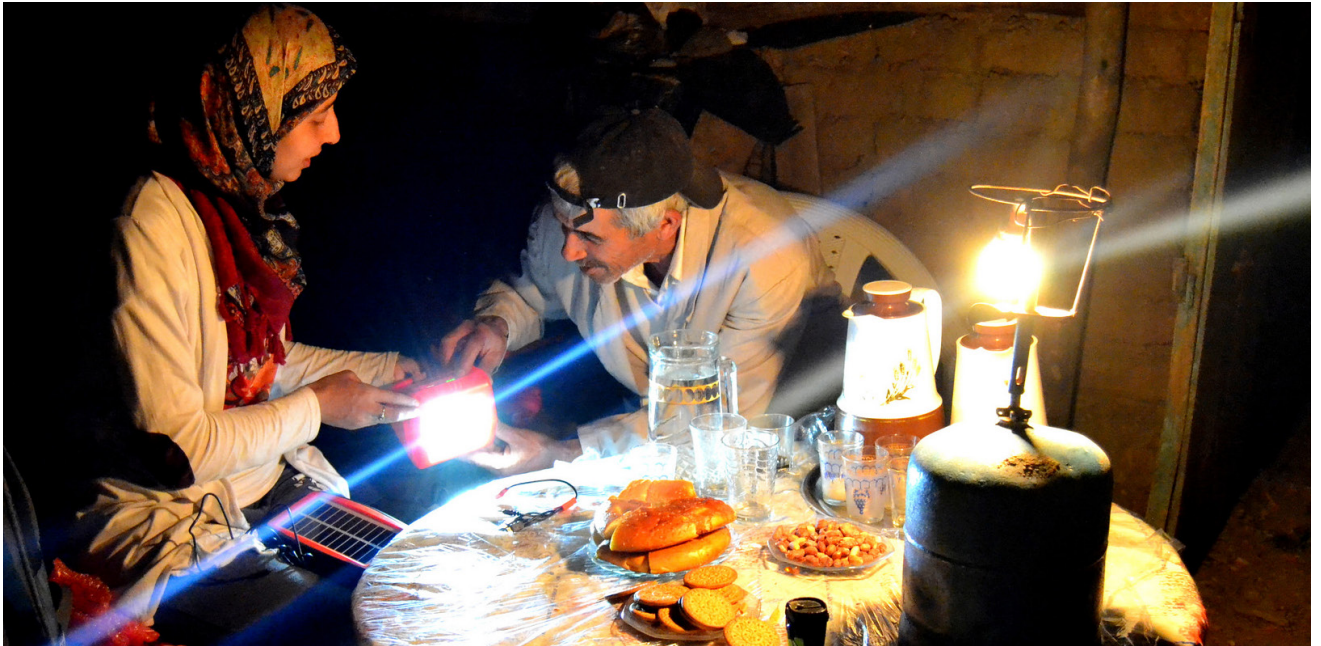
MIT D-Lab solar lighting technology evaluation, Morocco.

Although the Lean Research principles should be integrated throughout each phase of research, it is particularly important that they be established in the design and planning phase.