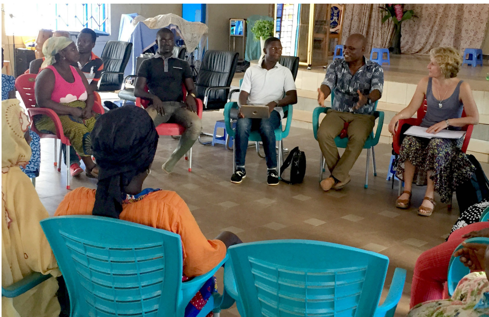
Research being conducted for a Living Income Benchmark Study, Ghana.

With regular reviews of simple-to-measure Key Performance Indicators (KPI) that anyone could check on, the relationship between the client firm and the producer community blossomed into one of deep trust, as each was able to see and maintain accountability for its commitment using tangible metrics rather than opinion or anecdote.