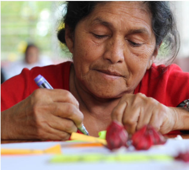
MIT D-Lab workshop participant, Estelí, Nicaragua.