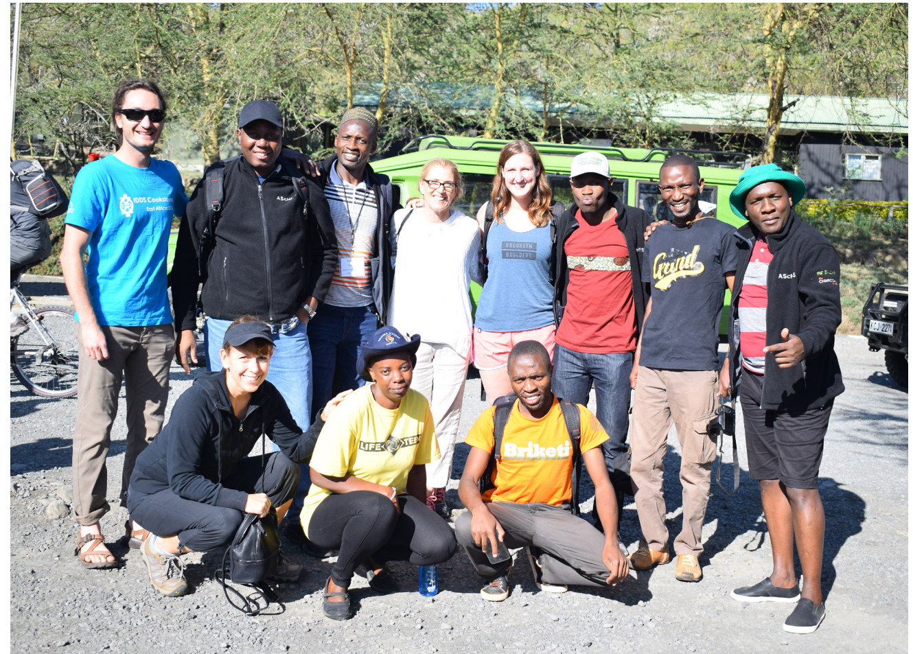
Group outing to Hell's Gate National Park.