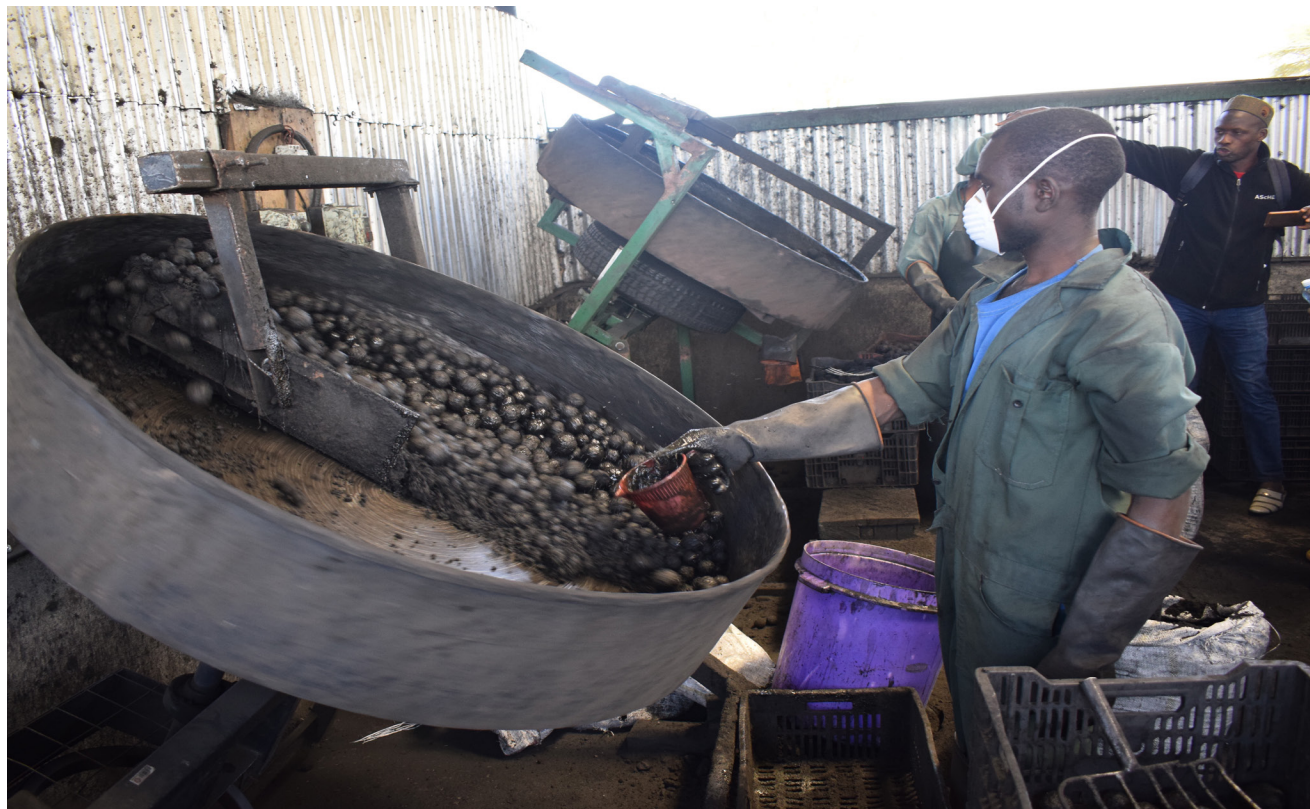
A Sanivation employee operates a briquette agglomerator machine.