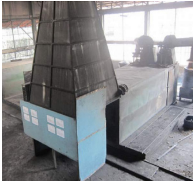
SGFE Tunnel Dryer.