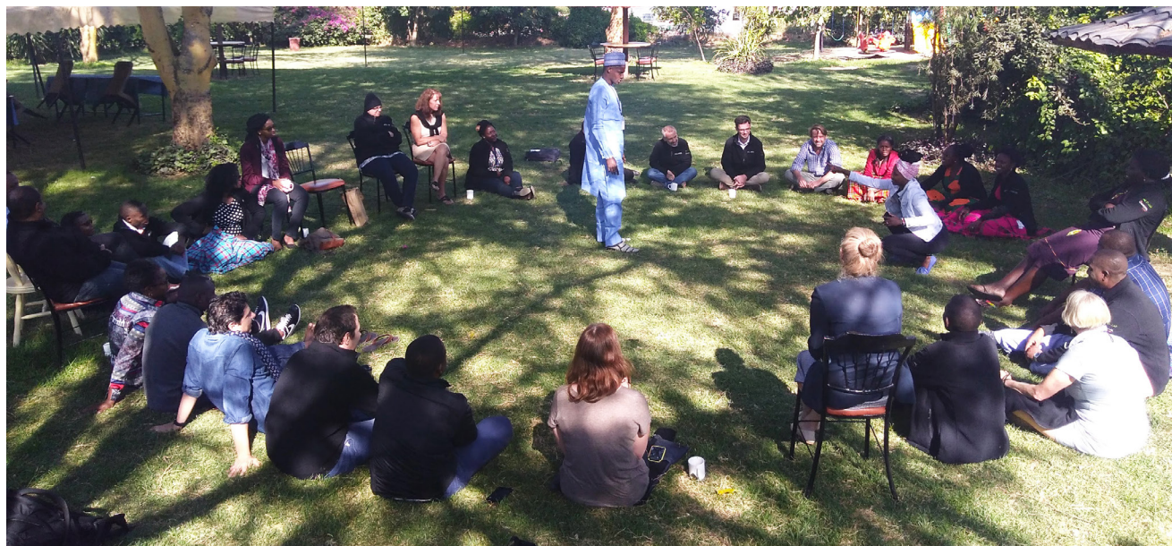
AScHES 2018 morning circle.