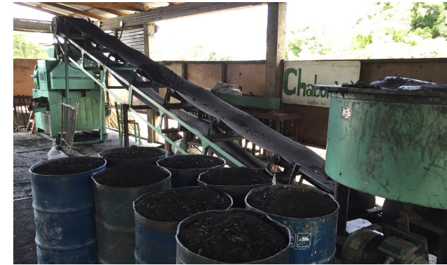
Charcoal briquette production line at Carbon Roots International.