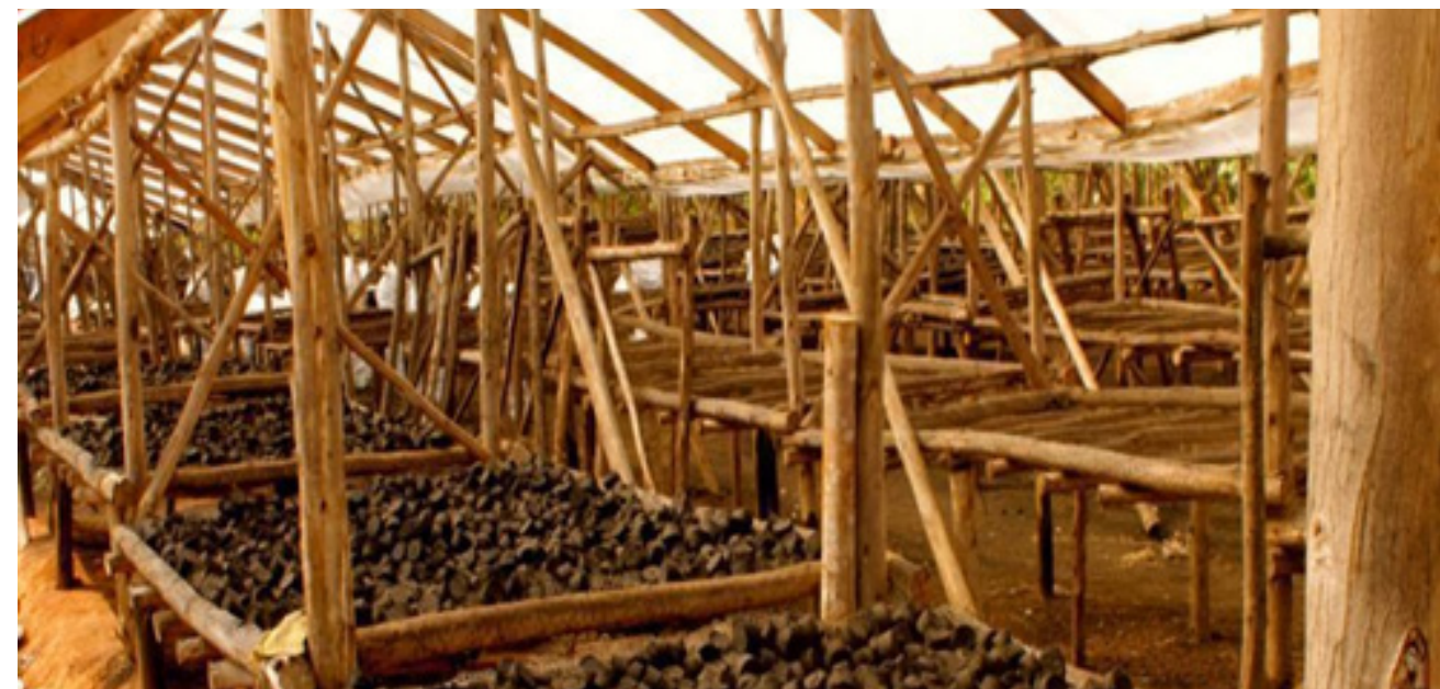
Green Bio Energy briquette sun drying with canopy.

Ziwa Hillington from Green Bio Energy presented on their sun-drying system that uses mesh racks on top of which several layers of wet briquettes are placed. The racks are covered with thick, ultraviolet (UV) light resistant polyethylene (PE)