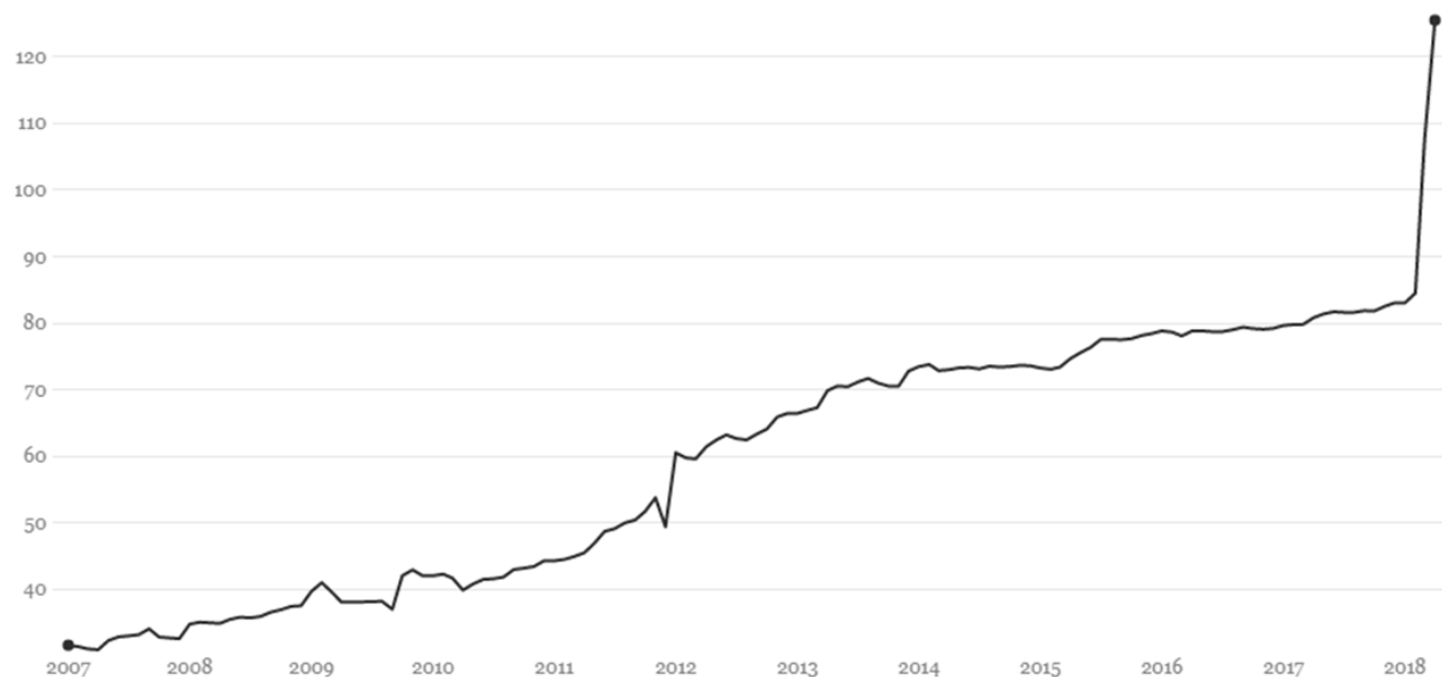
Figure 1: Charcoal price in Kenya (KSH/4kg tin).

Therefore, BURN is piloting co-branding and selling of briquettes along with their cookstoves.