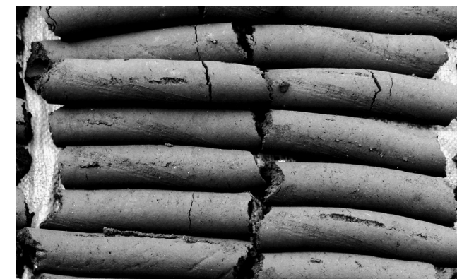
Example of charcoal briquettes.

The following report is a brief summary of the workshop activities and a discussion of the operation of the AScHES community moving forward.