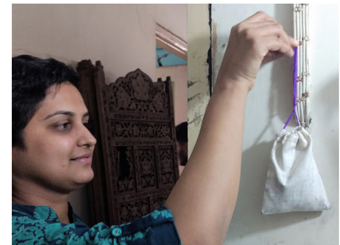
Organic deodorizer is just char powder in a cloth bag, for hanging in toilets, closets, cars, and other settings.