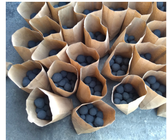
Sanivation's Makaa Ya Jamii briquettes being packaged for market.