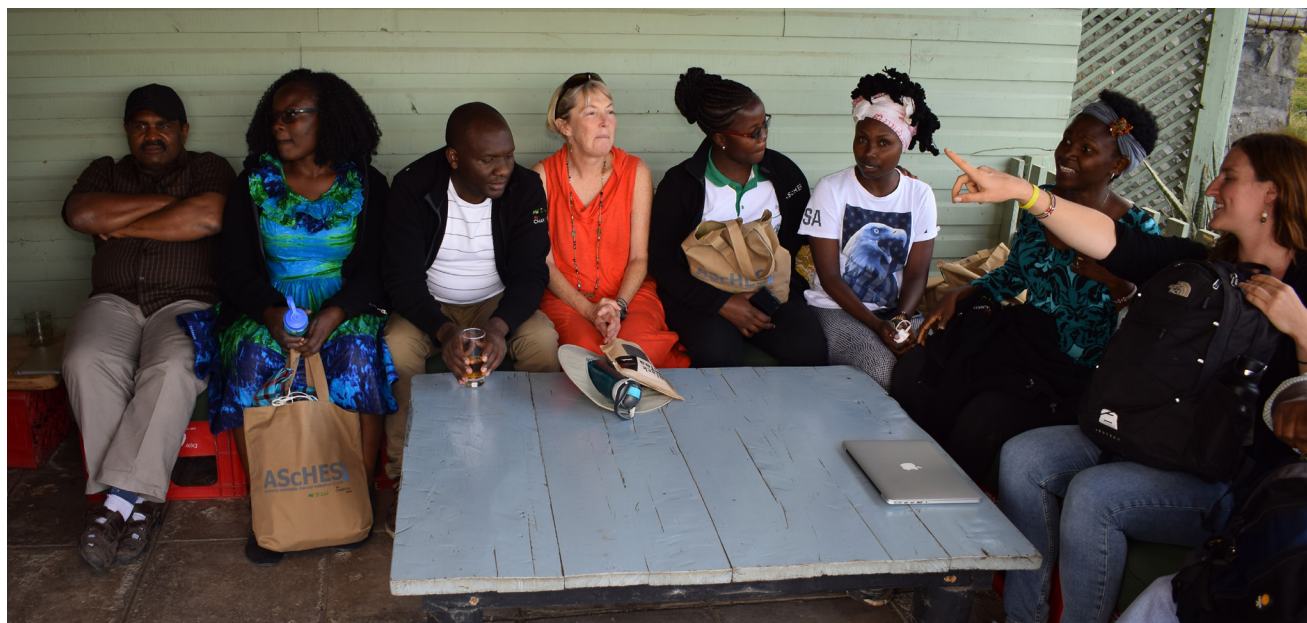
Community of Practice discussion at ASCHES 2018.