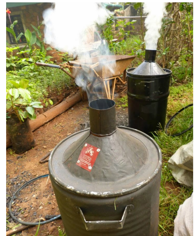
Cookswell Jikos charring demonstration.