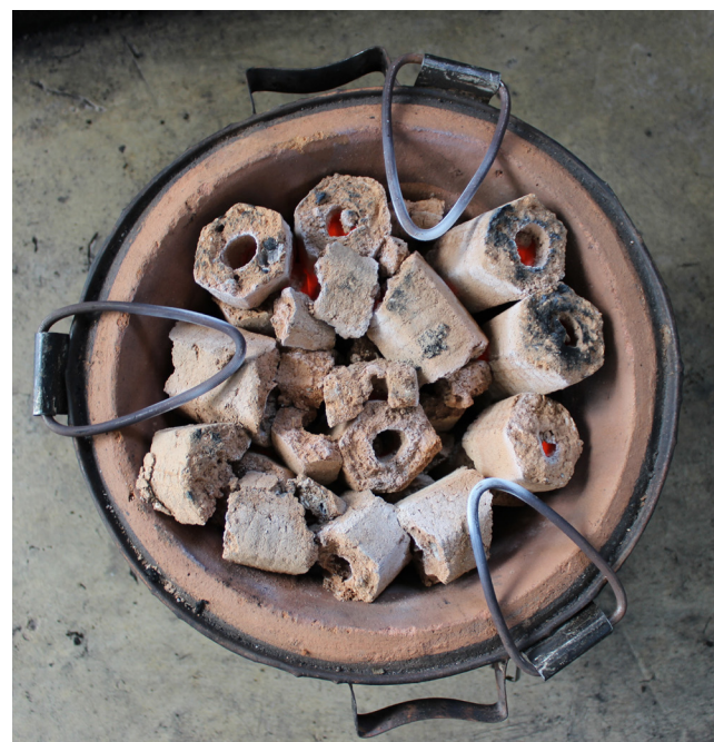
Charcoal briquettes in a ceramic jiko cookstove.