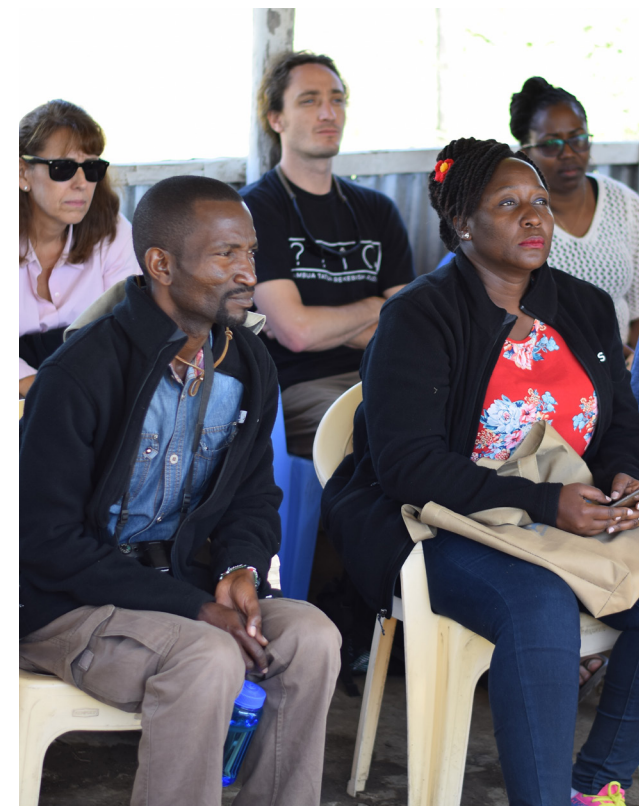
The group gets an introduction to Sanivation's operations on their trip to visit the company.