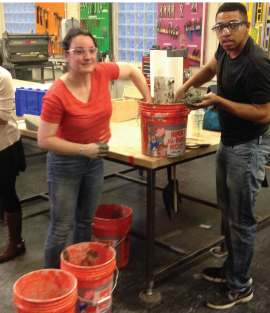
D-Lab students, fellows, staff and associates use the D-Lab workshop to learn and hone shop skills using a variety of hand and power tools. Open 24/7 to trained users, the shop is used for both class and field projects. The students above are working together to build a prototype of a clay cookstove.

d-lab.mit.edu/creative-capacity-building