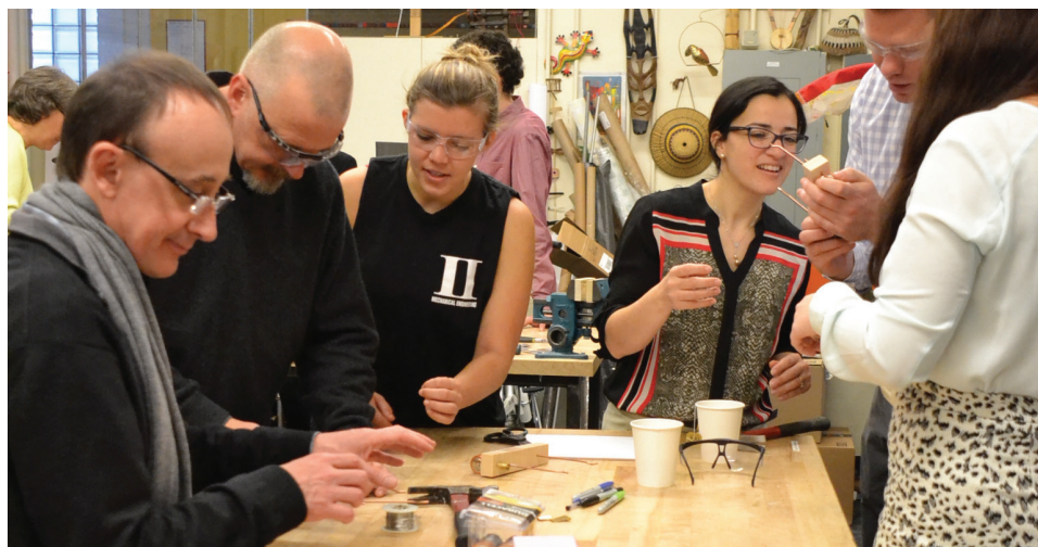
At the April 2015 Annual Meeting of the Practical Impact Alliance, members got a taste of D-Lab's hands-on Creative Capacity Building methodology in the D-Lab workshop.

Through the working groups, D-Lab works with members to produce practical working tools—best practices, decision-making frameworks, and other resources—to be broadly disseminated at year's end.