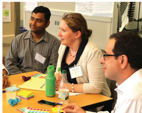
Lean Research Convening at MIT, August, 2014.

Lean Research is jointly organized by researchers at D-Lab, the Tufts University Fletcher School of Law and Diplomacy, and the Feinstein International Center also at Tufts.