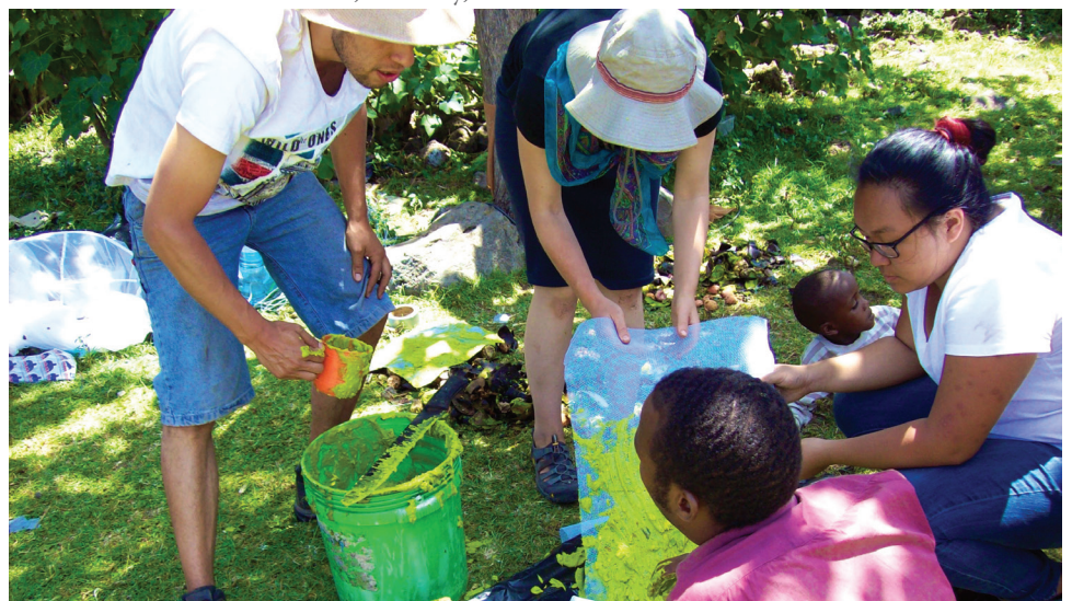
Each year, dozens of D-Lab students travel to do international fieldwork related to their coursework or research projects. Above, a student group from D-Lab: Development in Tanzania during the January Independent Activities Period explores avocado processing with members of the local community.